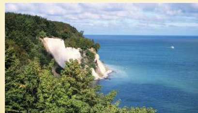
Tourist magnet: the chalk cliffs on the island of Rugen.

Nowhere in Germany has as much sunshine as Vorpommern - in fact, it has on average 2,000 hours every year. On the holiday islands Rugen and Usedom as well as the peninsula Fischland-Darss-Zingst, endless sandy beaches, white-washed Baltic Sea resorts, classy promenades and nature reserves are right on the doorstep. The islands provide ideal conditions for wind surfing and kite boarding, sailing, bathing or beach volleyball. Even cyclists, horse riders and canoeists are in for a real treat here. Cool parties are guaranteed by discotheques and bars, numerous clubs in the university towns of Greifswald and Stralsund, as well as some beaches. Behind the historical city walls of the Hanseatic towns, boutiques, shopping centres, cafes and restaurants invite you to shop and linger a while. With the Ozeaneum in Stralsund, the Königsstuhl National Park and the Pomeranian State Museum in Greifswald, the region commands three visitor centres of an international format.