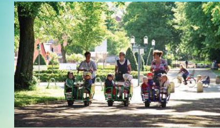
Good childcare and an abundance of nature makes Vorpommern attractive for families.

Ships, bridges and churches - in Vorpommern, people have always achieved great things. And even today, industry and craftsmanship continue to stimulate growth. With its tradition of craftsmanship, junior employees with skills and brains can shape their futures as mechanics, metal workers and electricians in Vorpommern. A master craftsman apprenticeship at the district's craftsmen's association gives such a career added momentum.