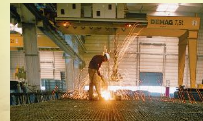
Craftsmanship and industry in Vorpommern provides job starters with diverse opportunities.