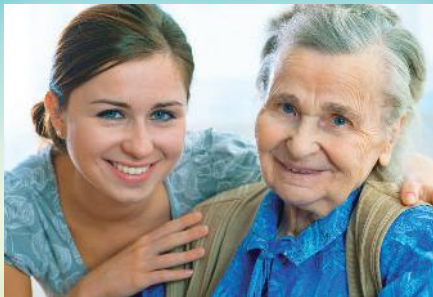
Nursing and therapeutic professions are in great demand.

Those who want to get started in the health care business can carry out a three-year nursing apprenticeship in Greifswald, for example. The numerous hospitals, specialist practices, health centres and nursing homes in the region ensure good opportunities for job starters.