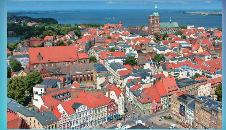
Medieval and modern: Many students from Germany and abroad live and study in the UNESCO World Heritage town Stralsund.