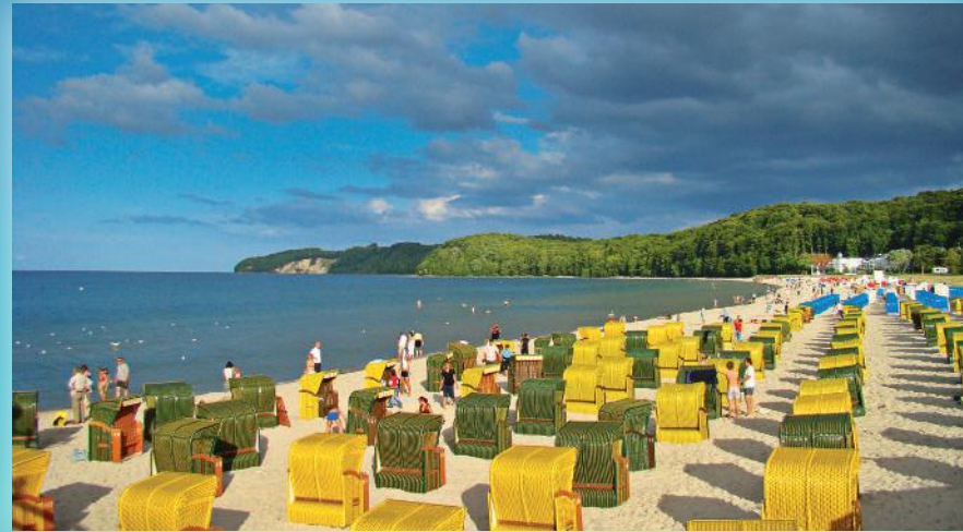
To be quick on the coastline - that stretches 1.700 kilometres - is no problem in Vorpommern.