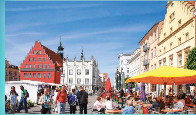
Enjoy the sun after a stroll through town. The many cafes and restaurants on the market square in Greifswald encourage you to linger a while.

Junior employees in the hotel and catering industry have particularly promising prospects here. For those who carry out a three-year apprenticeship in hotel and restaurant management or cookery, there are diverse opportunities in one of the most popular holiday destinations in Germany.